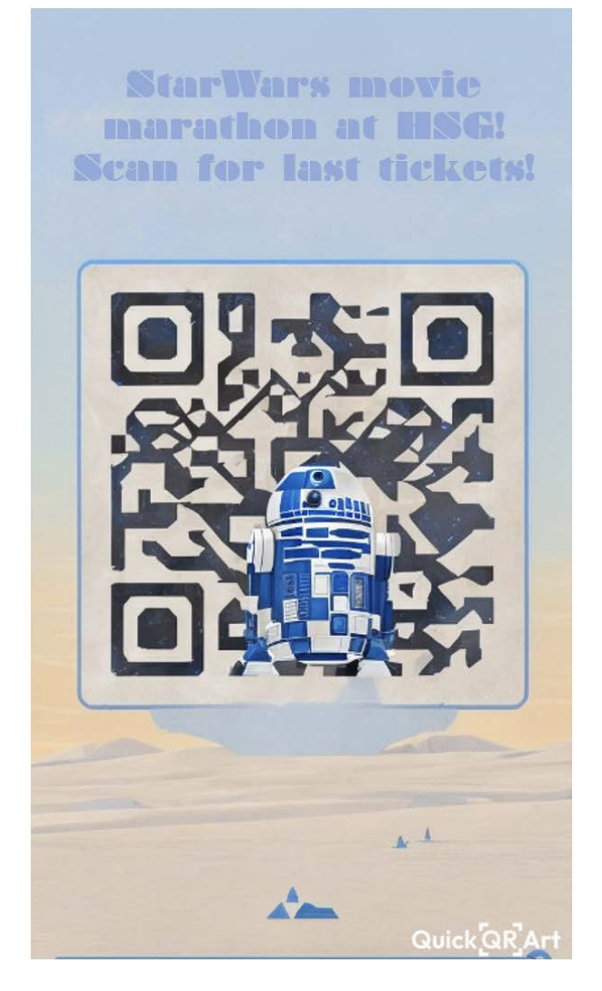
Figure 2: A poster created with https://quickqr.art/ showcasing the defense strategy proposed in 3.3.1

CHI EA '24, May 11-16, 2024, Honolulu, HI, USA