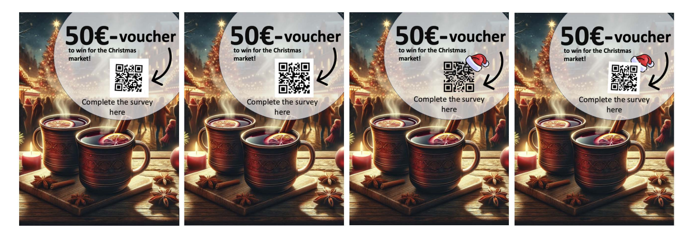
Figure 1: All posters used in the first user study at the Christmas market. From left to right (a) StandardQR tampered (b) StandardQR (c) SafeQR (d) SafeQR tampered.

Jannis Strecker jannisrene.strecker@unisg.ch University of St.Gallen St. Gallen, Switzerland