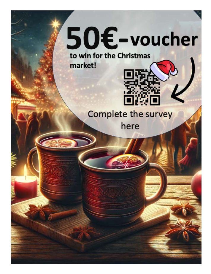
Figure 3: A poster used in the study that implements defense strategies of a SafeQR code.

The defense strategies proposed in Sect. 3.3 aim to address and protect users across all demographics and Information and communication technology(ICT) proficiency levels. These strategies, particularly the visual safety elements incorporated in QR codes,