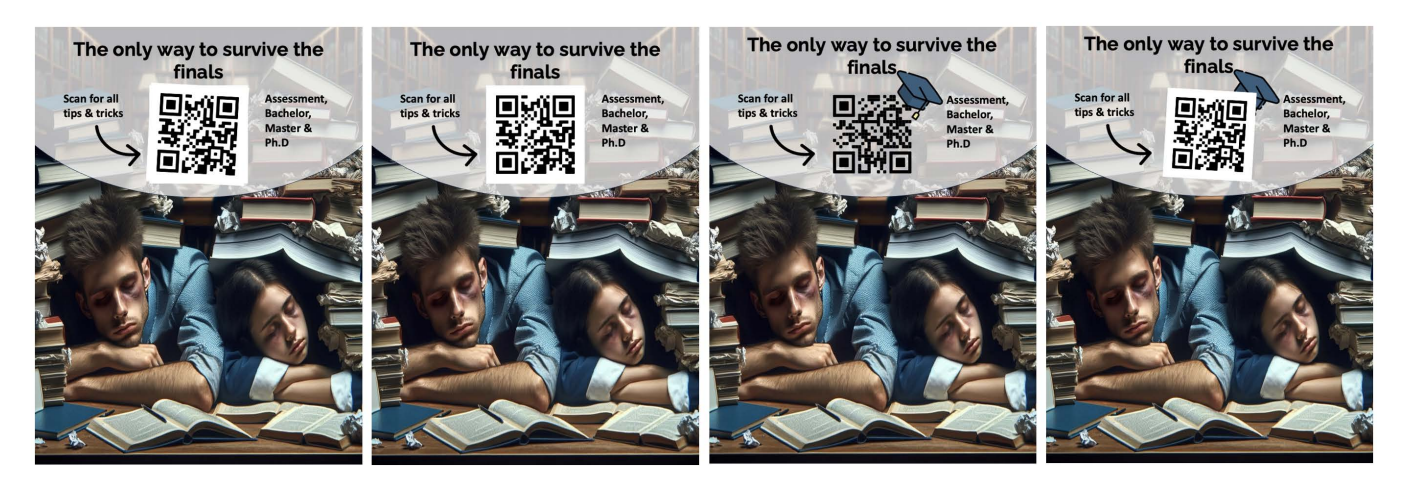
Figure 5: All posters used in the second user study at the University. From left to right: (a) StandardQR tampered (b) StandardQR (c) SafeQR (d) SafeQR tampered